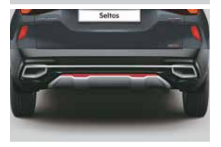
Adds to the tough looks and provides a strong road presence