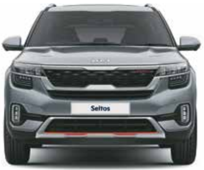
The GT line with its sporty, youthful design, and innovative features, appeals to the 'Young at Heart' consumers.