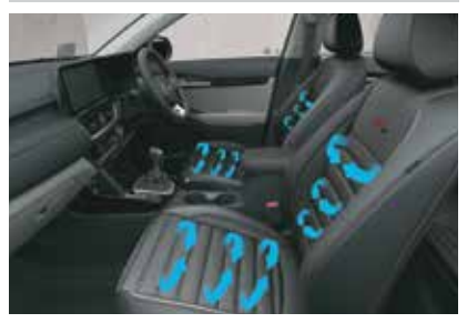
Enhance comfort and convenience, making every drive you take a memorable experience