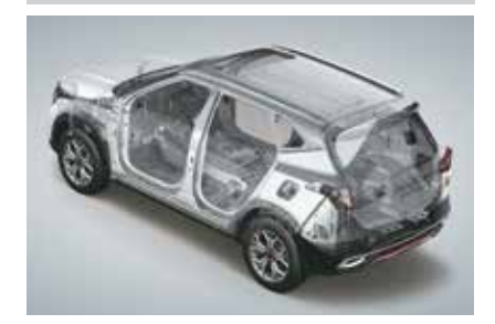
Provides enhanced safety and rugged strength to your Kia Seltos