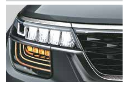
Provide a distinctive bold character and better visibility in the dark