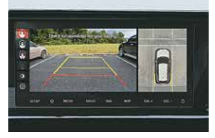
Keeps you aware of your surroundings at all times