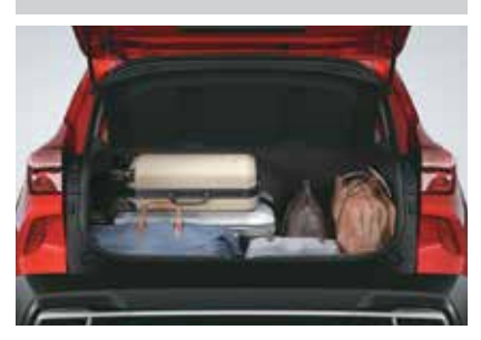
Designed for easy access, it's spacious enough to accommodate luggage for a weekend trip