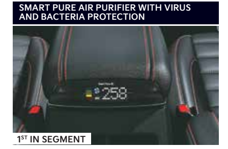
Lets you and your loved ones breathe the cleanest air inside the car