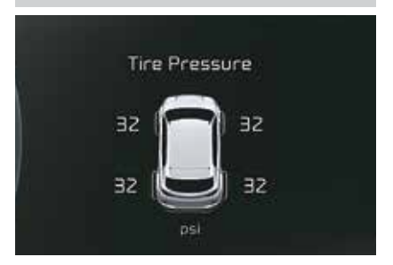
Displays real-time tyre pressure information and alerts if the pressure falls below the recommended levels