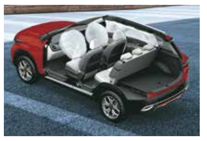
Provide superior safety making your every drive safe and worry-free