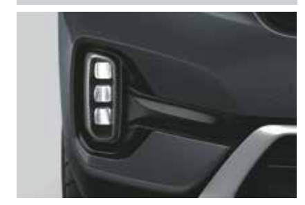
The distinctive shape of the fog lamps enhances its overall sporty looks