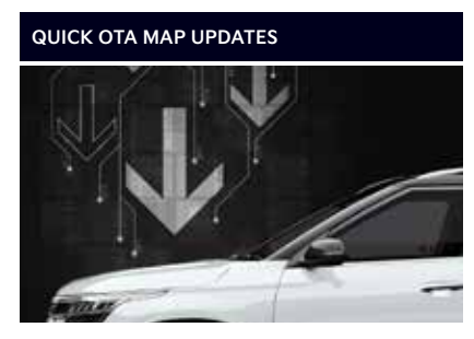
Ensure that your car is always up-to-date to take you to the new roads