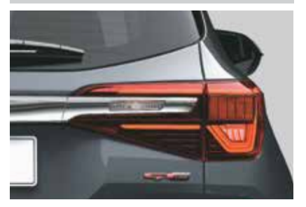
The striking design complements the muscular back to give it a premium appearance