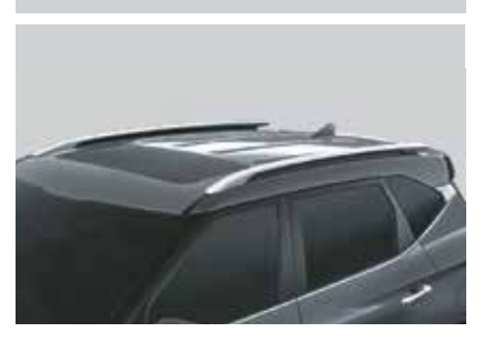
Lets you stay connected to the outside world