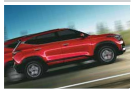
Prevents the vehicle from rolling back during uphill climb from standstill