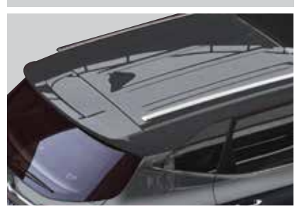
Give a sporty and dynamic appeal to the badass design