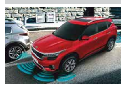
Help you safely maneuver and park in peculiar Indian conditions