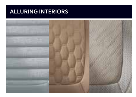
Let you enjoy shades of your personality in your car