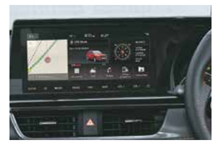
Makes the cabin look plush and futuristic that keeps you stay connected to find your way effortlessly