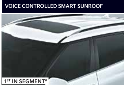
Now operate the sunroof and driver side window simply with your voice