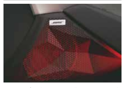
Is a treat for the ears. It will set your mood right for every drive