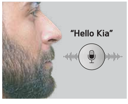
Provides an enhanced & connected car experience