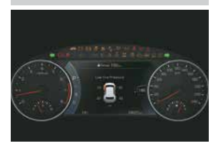
Displays information which is very easy to read in all light conditions that enhances your overall cabin experience