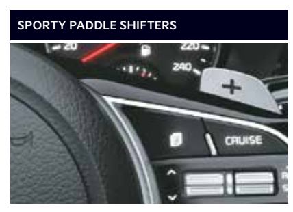
Help in quick gear shift just with your finger for a sporty and immersive driving experience