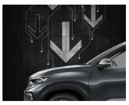
Offer latest Map updates conveniently via Over-the-air Technology