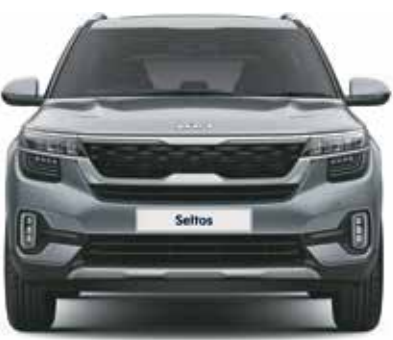
The Tech line with its premium looks, appeals more to the comfort and technology seeking family-oriented consumers.