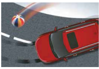
Enhance your safety while braking and allow you to stay in full control of your Kia Seltos