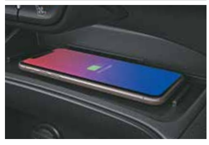
Conveniently charges your phone on the go to ensure that your phone never runs out of battery