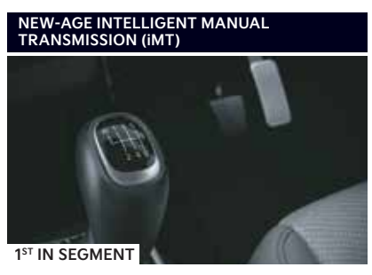
Allows you to enjoy the ease of driving with clutch-less* manual transmission