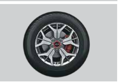
Are absolute showstoppers. One glance, and you'll know why