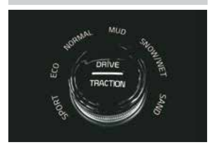
Let you adapt to different driving conditions and stay in control at all times