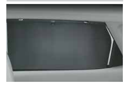
Protects you from direct sunlight for a comfortable journey