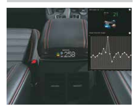
Fights against virus and bacteria while monitoring AQI status